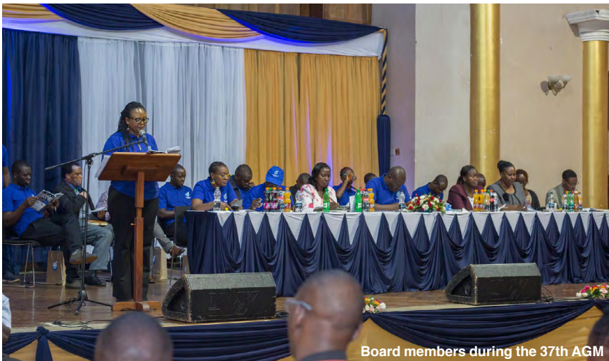
Board members during the 37th AGM

FOLLOWING THE RECENTLY HELD AGM, THE BOARD OF DIRECTORS SERVING YOU IN YEAR 2020 IS AS FOLLOWS: